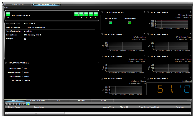
▲ A drill down view from NeuralStar SQM shows the status of a device in the downlink service.