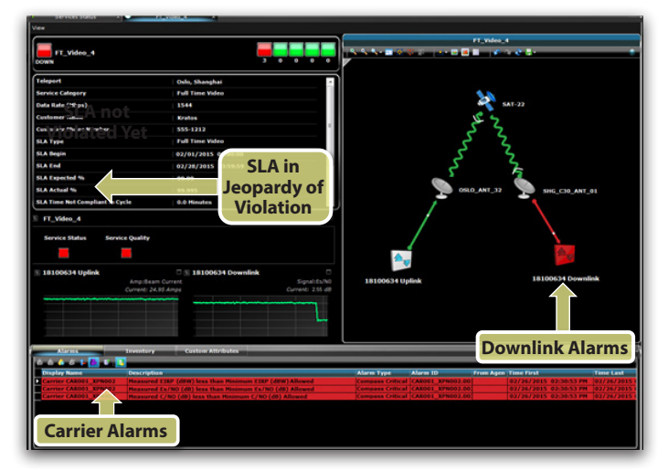
Identifying Impacted Service Segment and SLA Status.

NeuralStar SQM provides an end-to-end services view from the uplink to the downlink through the device chain, antenna, and carrier that transmits service data to the satellite. In this view it is clear there is a service delivery problem with the downlink which is color coded red with a critical alarm. It is affecting the service delivery of the video to the Shanghai teleport. The service status and quality for the service indicates "Failed". By comparing the actual vs expected SLA performance it becomes clear the SLA is in jeopardy of being violated. To get to the next level of detail, one of the critical carrier alarms is clicked on by an operator and the carrier performance summary is displayed based on data from Kratos' integrated carrier monitoring product Monics.