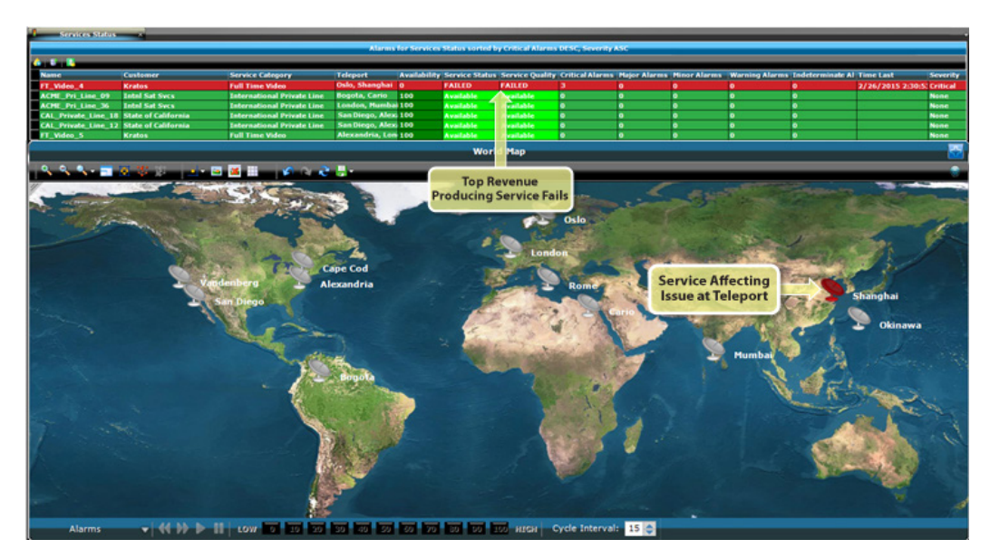
Monitoring top services throughout global teleport operations.

When a top revenue producing service, such as video goes down, NeuralStar SQM displays a critical red alarm in the grid. The Key Performance Indicators (KPIs) including service status, quality and availability show a service failure.