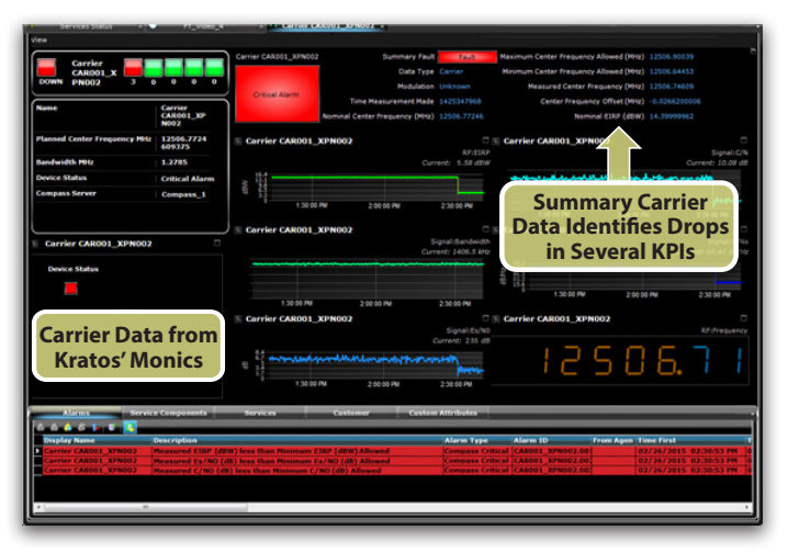
Determining root cause by analyzing carrier performance.