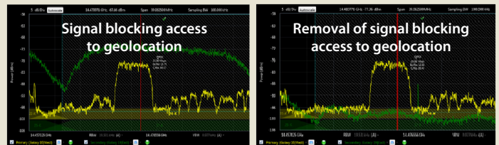
▲ Display shows signal blocking access to geolocation and then being removed using Monics satID.

Remove signals in real-time which could compromise geolocation performance, such as a blocking access on the adjacent satellite. Improve geolocation efficiency and effectiveness.