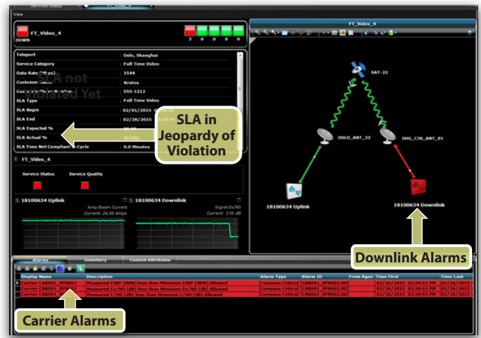
Identifying Impacted Service Segment and SLA Status.

NeuralStar SQM provides an end-to-end services view from the uplink to the downlink through the device chain, antenna, and carrier that transmits service data to the satellite. In this view it is clear there is a service delivery problem with the downlink which is color coded red with a critical alarm. It is affecting the service delivery of the video to the Shanghai teleport. The service status and quality for the service indicates "Failed". By comparing the actual vs expected SLA performance it becomes clear the SLA is in jeopardy of being violated. To get to the next level of detail, one of the critical carrier alarms is clicked on by an operator and the carrier performance summary is displayed based on data from Kratos' integrated carrier monitoring product Monics.