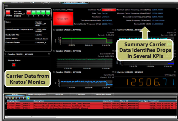
Determining root cause by analyzing carrier performance.