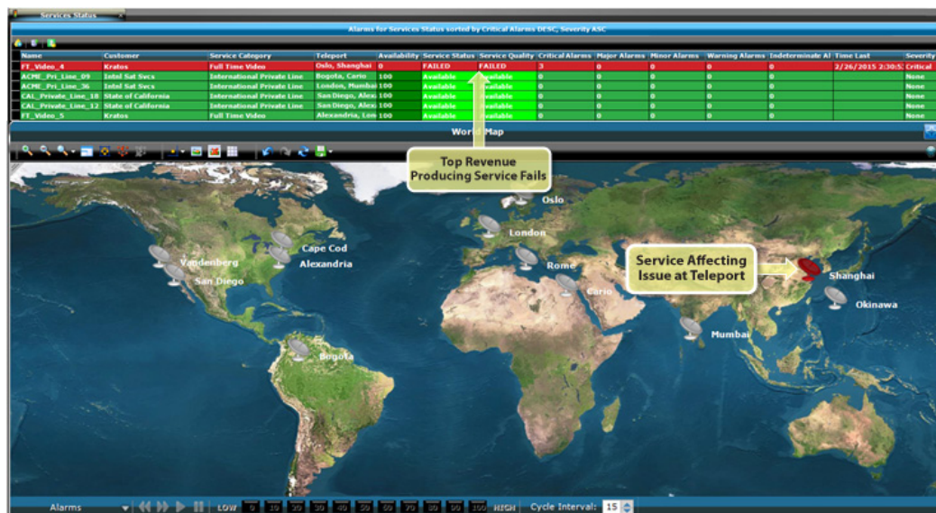
Monitoring top services throughout global teleport operations.

NeuralStar SQM also displays which teleport is affected – in this case Shanghai. By clicking into the critical alarm for the video service, the process to identify the issue and resolve it begins.